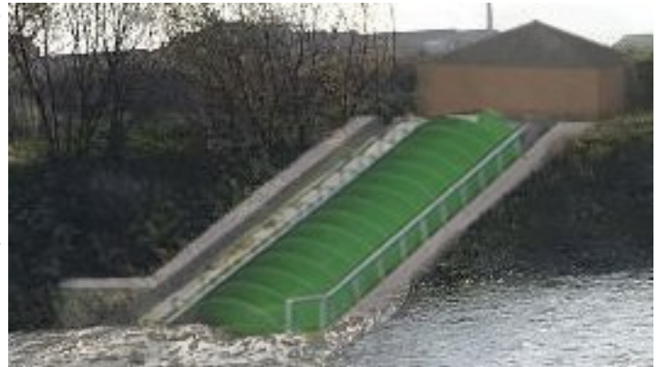
Artists impression of The Archimedes Screw

Sheffield Renewables and South Yorkshire Energy Centre are teaming up to run fun activities for children, a range of volunteering and learning opportunities, and a blitz on cold, draughty houses. It is planned that Energy Buzz and Jordan Dam Hydro will be part-financed by the European Union's European Regional Development Fund. Getting planning permission is a big seal of approval for Jordan Dam. The next big challenge is raising £250,000 towards building costs through a share offer open to individuals, organisations and businesses.