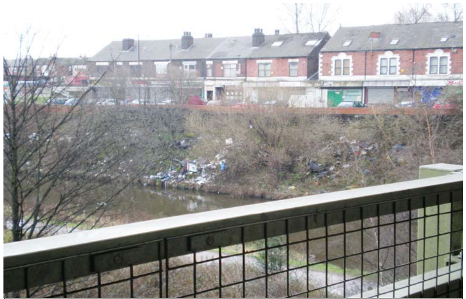
Rubbish on the canal bank Old Sheffield Road

Tinsley Forum have had a lot of complaints about the rubbish on the canal bank. If it's local people who are dumping please think about your family and neighbours having to walk past this mess when walking to the tram stop or to Meadowhall. It's been bad for years. In the winter months when the foliage on the bank dies back it looks particularly bad. A lot of the rubbish seems to be household rubbish. Wheelie bins left on the pavement end up down the canal bank. It is also easy to lift rubbish from vehicles and throw it over the wall from Sheffield Road. After representations by Tinsley Forum, British Waterways who are responsible for the canal are to clean up the bank in the next few weeks. The developers currently building on Sheffield Road want to knock down the old Sauna on the corner of Wharf Road and make environmental improvements. Tinsley Forum working with British Waterways , Sheffield City Council and the Developers are keen to improve this important green area of Tinsley. Anybody caught dumping in this area is liable to a fine of up to £2000.