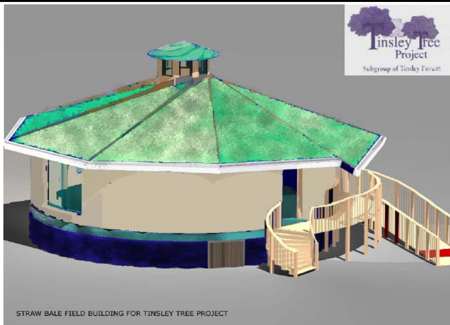
STRAW BALE FIELD BUILDING FOR TINSLEY TREE PROJECT

Once completed, the building will be open to all, providing an accessible space at which to hold public events and meetings and to carry out environmental education activities. The building will also provide much needed shelter for participants at the Community Allotment.