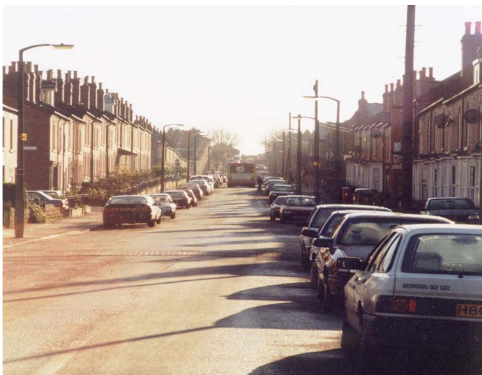
A Tinsley streetscene

The key objectives to come from this aim are to improve the quality of and the choice within the housing market in the chosen area. The changing needs and aspirations of local people will play the most important role in shaping the future development of Tinsley. With a view to this Transform South Yorkshire are funding a Masterplanning process that will cover the Darnall, Attercliffe and Tinsley area. The purpose of the finished Masterplan is to act as a guide to future development, to help attract developers and to act as a focus for regeneration efforts. The independent consultants ap-