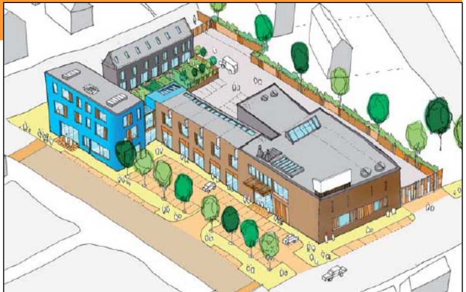
Highgate Centre Option 3

In January 2009, the Team visited a number of different locations within Tinsley in a large red bus to ask local people their views on the 4 options. In addition, residents were asked to complete questionnaires which were analysed in depth. These gave positive feedback for both Options 3 and 4 but overall, Option 3 was preferred because the shops and parking were clearly visible from Bawtry Road. In May 2009, local residents and businesses were invited to