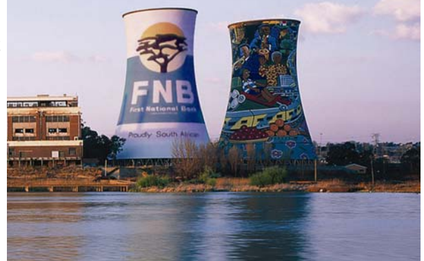
Orlando Power station Cooling Towers Soweto South Africa

insisted that the towers should be demolished soon. .But there are considerable technical issues to be resolved with the Highways Agency before