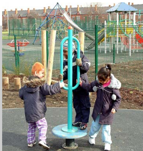
Children in Playground