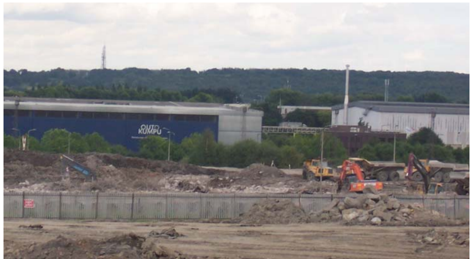
site clearance work ahead of building Polestar's Printing Works next to Outo Kumpu on Shepcote Lane Due to open March 2005