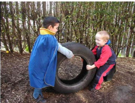
Children playing at Roundabout Centre

The outcome of the inspection concluded that children are making good progress toward the