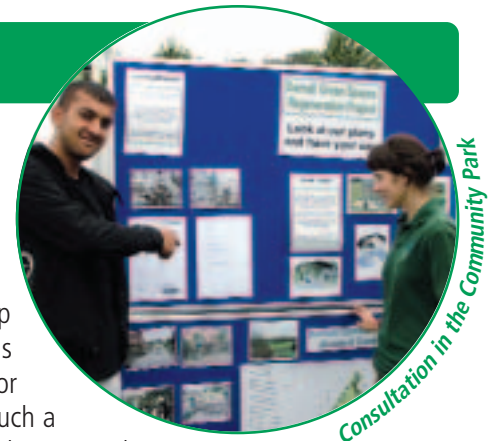
Consultation in the Community Park

Thanks to all the funders who have supported this project, including: Awards for All, Sheffield City Council Small Grants Scheme, Evolve, Sheffield Town Trust, Church Burgess Foundation, and The Graves Trust. The work they have funded is a real investment in improving Green Spaces for the people of Darnall.