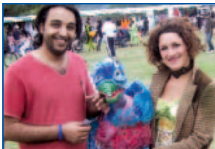
Puppets kept the young and old entertained