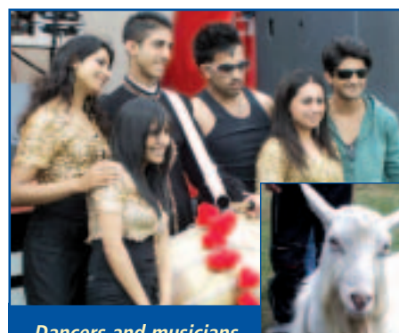
Dancers and musicians doing the 'Chak De Pattey' – No kidding!

We would like to thank you all for making it a huge success by being there. There is nothing better than to see the whole community together at an event enjoying themselves.