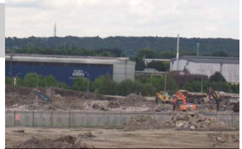
Site clearance work ahead of building Polestar's Printing Works on Shepcote Lane

Pre Employment Training will be available. Don't waste any time if you are interested, visit the Jobs Fair on 17th August where