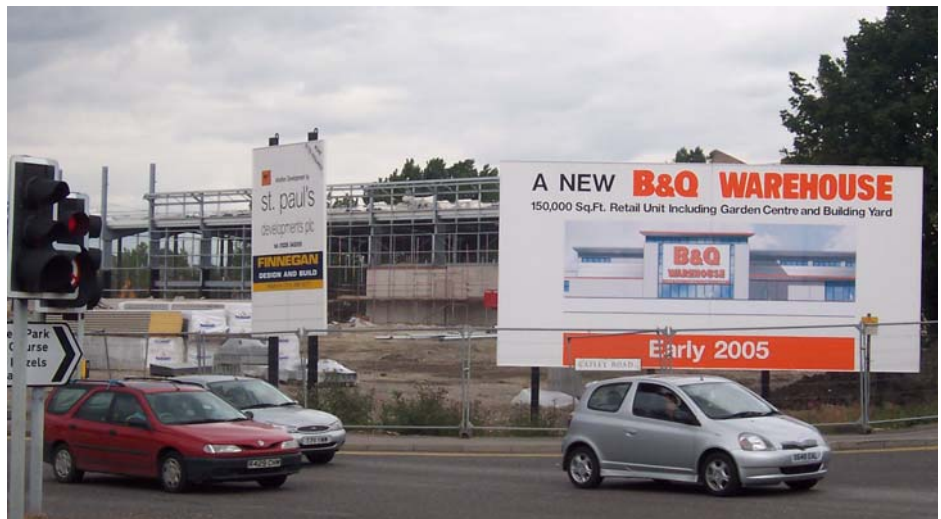
The new B&Q Warehouse being built on Greenland Road will need 250 staff

B &Q are opening a DIY Warehouse on Greenland Road in January 2005 and will want around 250 staff. Information will be available at the Jobs Fair about these jobs and pre-employment training you might want to participate in. Contact Tony Hall on 2755106 if you can't get to the Jobs Fair