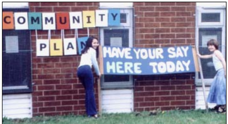
More than 400 people took part in our well-advertised local consultations!

You have determined the priorities, now we need to examine the practicalities of getting the funding to make these projects happen. Not all projects can be funded by Objective One and so we will need to find other sources of funding, but we have already started working on this.