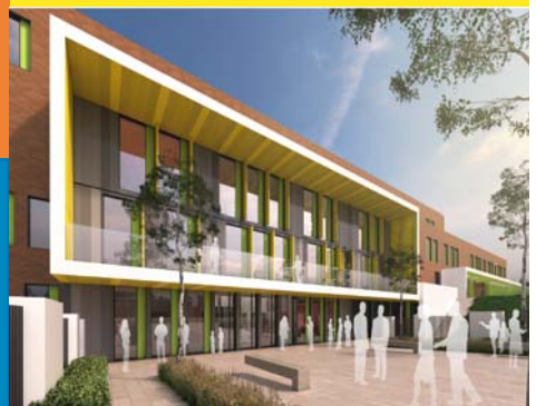
New School for Darnall Area see inside