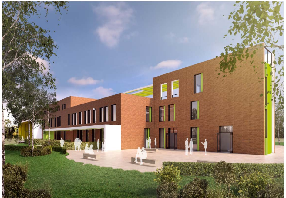
The School viewed from Worksop Road